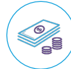
Loss of Rental Income