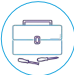
Wear and Tear