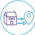
Off Premise Losses