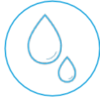
Water Backup of Sewer, Drain or Sump