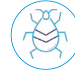
Bed Bug Remediation