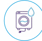
Overflow of Appliances